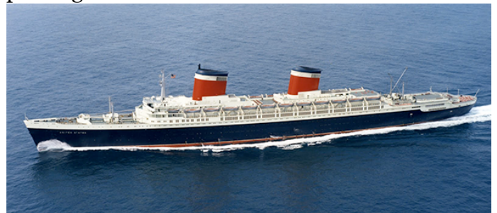
SS United States