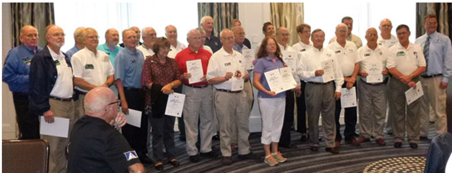
All 20 Squadrons of District 27 received a Cooperative Charting Award. Our Commander is wearing red.