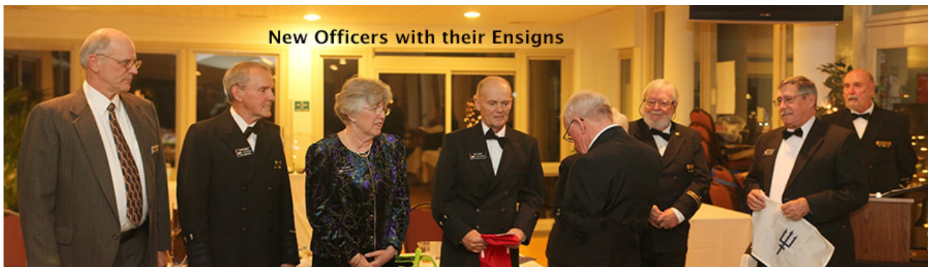
New Officers with their Ensigns

Articles in the Cape Lookout Outlook reflect the opinions of the authors. USPS is not responsible for editorial content. Readers' comments, suggestions, and contributions are welcome. Please contact any of the bridge officers.