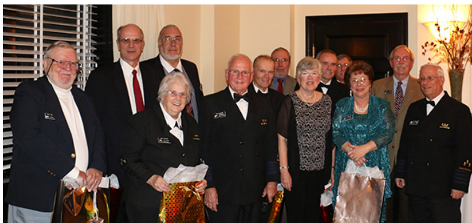
Old Bridge & Exec Committee