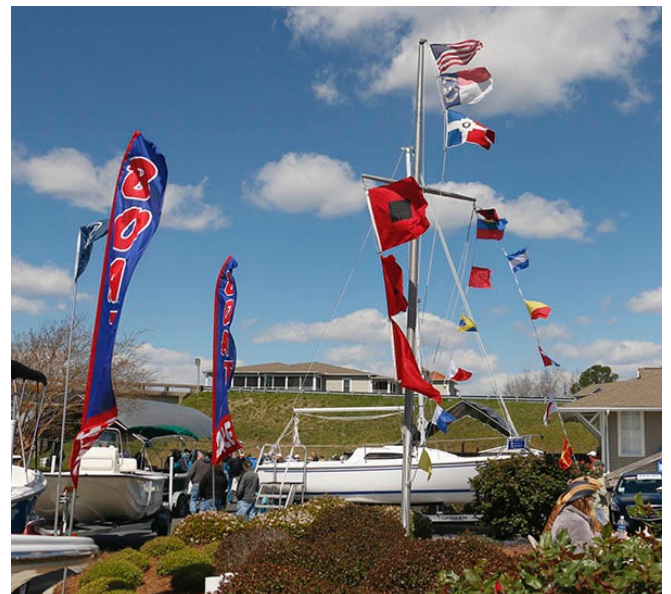
Windy Oriental Boat Show