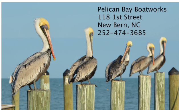
Pelican Bay Boatworks 118 1st Street New Bern, NC 252-474-3685

Pelican Bay Boatworks, 118 First Street in New Bern, made a $100 donation to subsidize lunch for the students on both Saturdays. This allowed an efficient lunch break, and made it possible to resume class quickly after a satisfying noon meal. Thank you Pelican Bay!