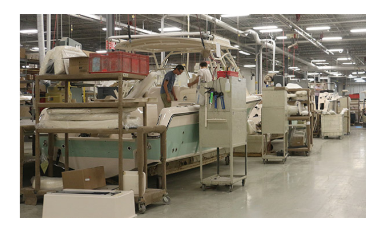
Assembly Line at Grady White