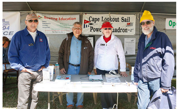
2016 Oriental Boat Show CLSPS Booth