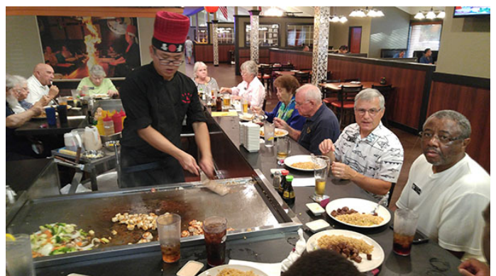
CLSPS at Sake Sushi Grill