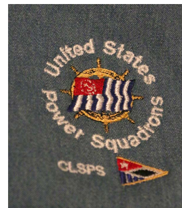
Logos found at the Ship’s Store