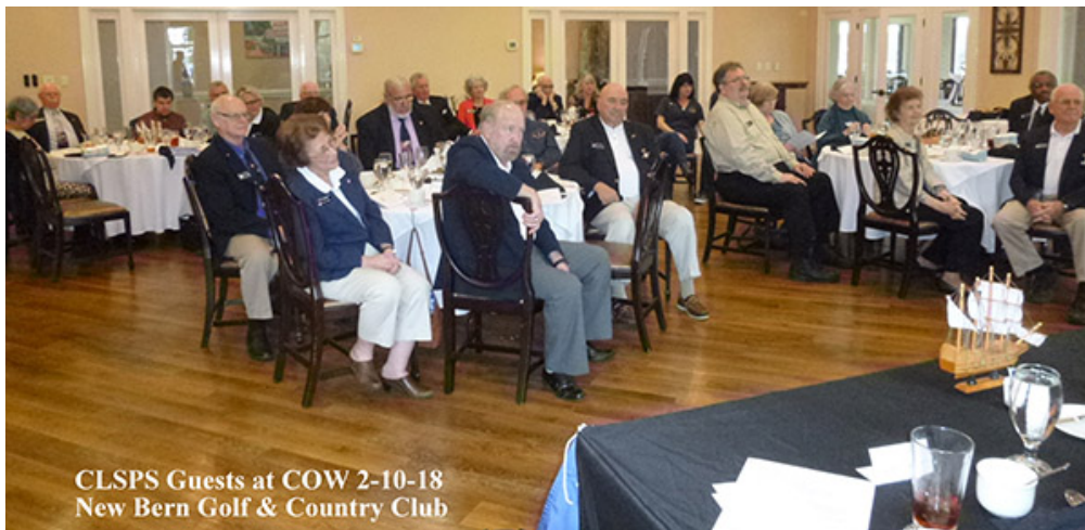
CLSPS Guests at COW 2-10-18 New Bern Golf & Country Club