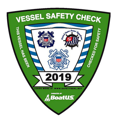
Cape Lookout Sail & Power Squadron has conducted 433 Vessel Safety Inspections as of early June!