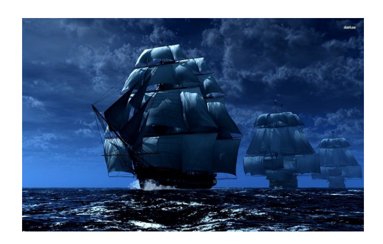
Who's got Right-of-Way here?

"P/C, I recommend we all take time to read the rules of the road, horn and light requirements before heading out onto the local inland waters. When passing one another we frequently are in tight quarters. Reviewing a little each day may be just what the inshore boater needs. Stay safe!"