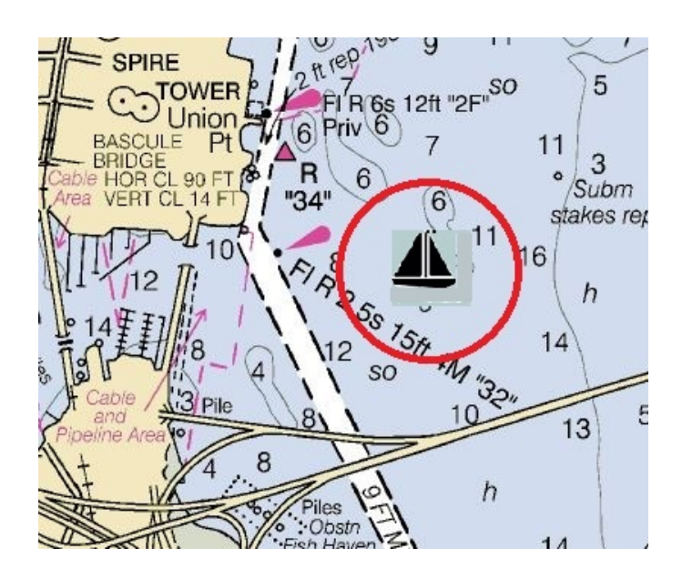
Location for the July 4 Raft-Up off Union Point Park