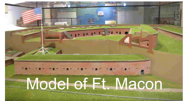
Model of Ft. Macon