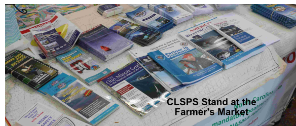
CLSPS Stand at the Farmer's Market