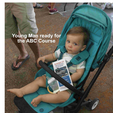
Young Man ready for the ABC Course