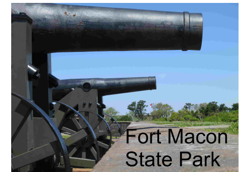
Fort Macon State Park