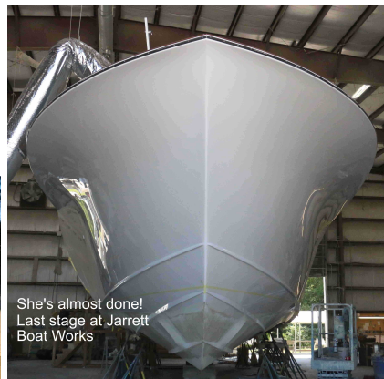
She's almost done! Last stage at Jarrett Boat Works