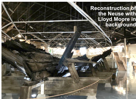
Reconstruction of the Neuse with Lloyd Moore in background