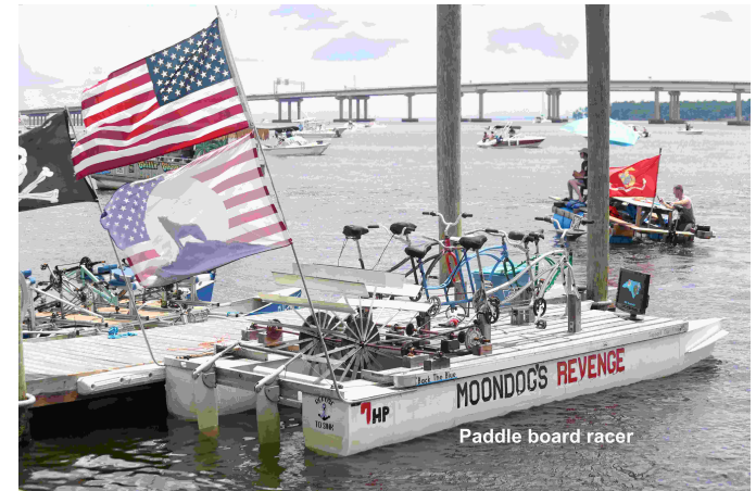
Paddle board racer