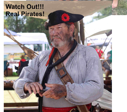
Watch Out!!! Real Pirates!