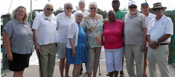
Tour Group at Hancock Marina, Cherry Point MCAS