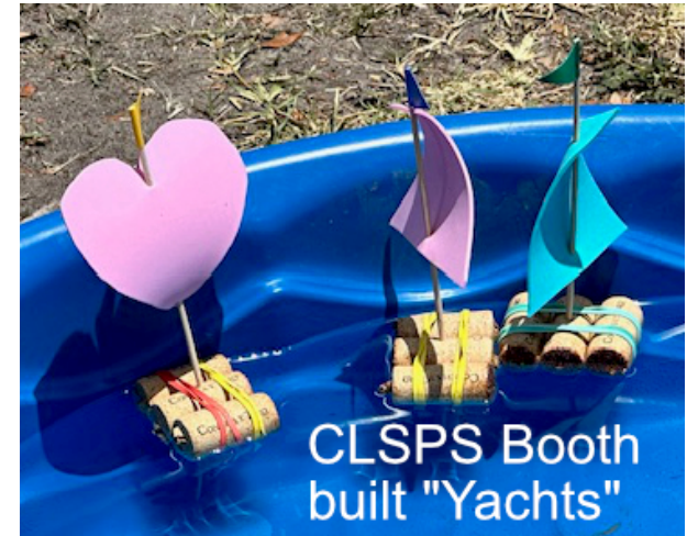
CLSPS Booth built "Yachts"